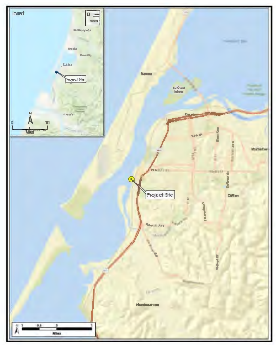
Figure 1. Project Site and Location Map

Timber piles will first be cut off 0.3 meters below the mudline and will then be removed using a crane located on a floating barge. The exact method of removal using the crane will be determined by the contractor. Pile replacement shall be with 0.41-meterdiameter coated steel piles installed to a depth of -40'. Once piles are replaced, new guide systems and bracing systems will be installed on the floats and new piling for the floating dock and causeway piles respectively. All steel piles will be driven to tip elevation or refusal using a crane and a vibratory hammer. If refusal occurs before tip elevation is reached, an impact pile-driving hammer will be used to drive the piles to the required tip elevation, completing the installation. Timber piles will be removed using a