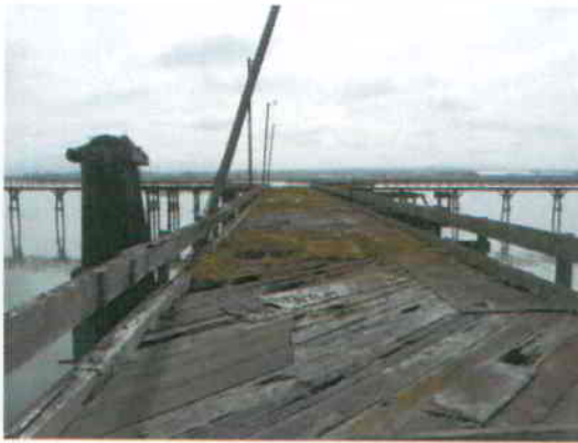
3. Phase 1 Work Site from West to East