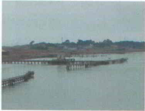
1. Redwood Terminal Berth 2