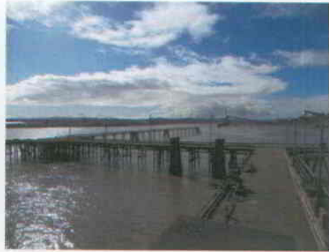
2. Redwood Terminal Berth 2 Phase 1 Work Site