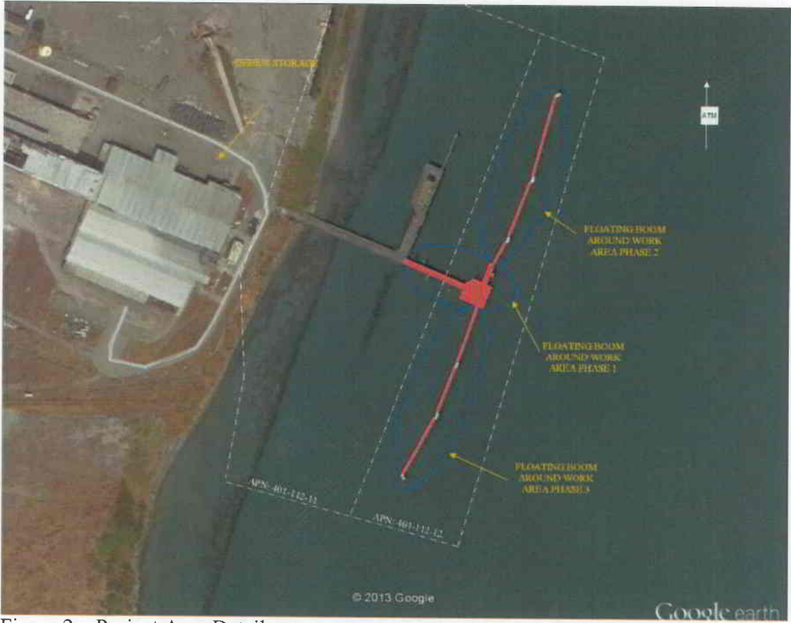
Figure 2 – Project Area Details