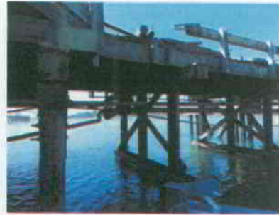
4. Work Site Piling Structure