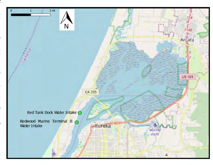
Figure 1: Location of proposed water intakes in Humboldt Bay, California.

and Wildlife (CDFW), U.S. Army Corps of Engineers (USACE), and the North Coast Regional Water Quality Control Board (NCRWQCB). The project also requires a Harbor District Permit. Consistent with District Ordinances and the Harbors and Navigation Code, an application was filed and accepted for filing by the Board on March 4, 2022, a Notice of Application was published and sent to adjacent property owners and regulatory agencies. The County of Humboldt is the CEQA lead agency and certified an Environmental Impact Report (EIR) for the Samoa Peninsula Land-based Aquaculture Project (SCH#2021040532) on August 4, 2022. addition to the water intakes, the EIR, which California. was approved by the County, evaluates upland