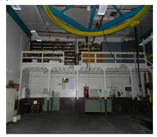
Shops and Stores